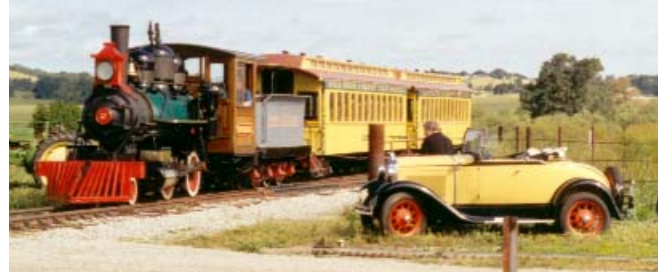
Vulcan 2-4-0 steams into the station area at Santa Margarita Ranch. Beautifully restored Model A convertible is on display near the tracks. Many nice old cars were on hand for the roundup.