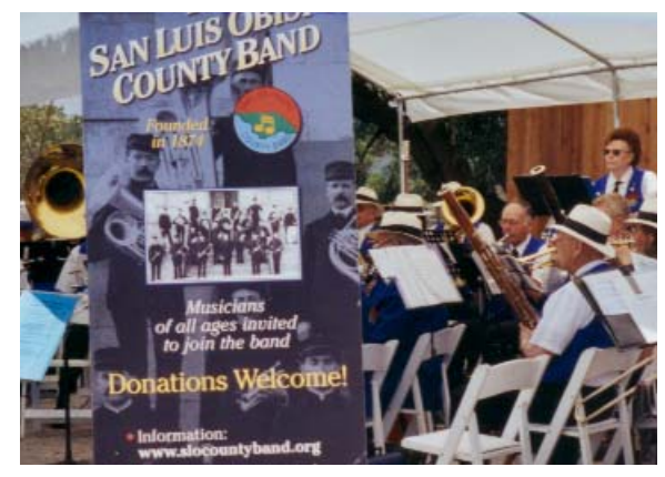
The San Luis Obispo County Band entertained on Saturday, playing vigorous renditions of old favorites.