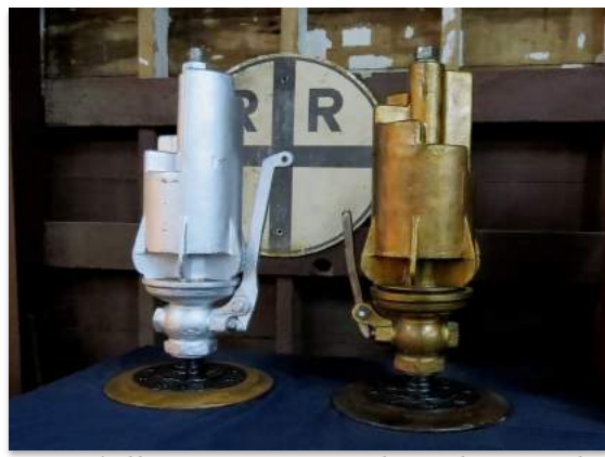
Visitors, especially younger ones, love the sounds of the steam locomotive bells at the Museum. Soon they may be able to hear the sounds of whistles too, though by audio rather than by steam blasts that could hurt the ears of everyone close by (whistles now at the Museum are shown).