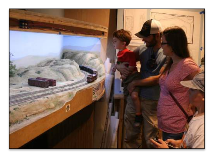
Above, visitors at the Railroad Festival watch a freight train leaving the location of Surf (photo by Gary See).

Lower left, a Southern Pacific cab-forward locomotive's headlight gleams on the rails as it prepares to depart Surf on the Museum's model railroad (photo by Tom Grozan).