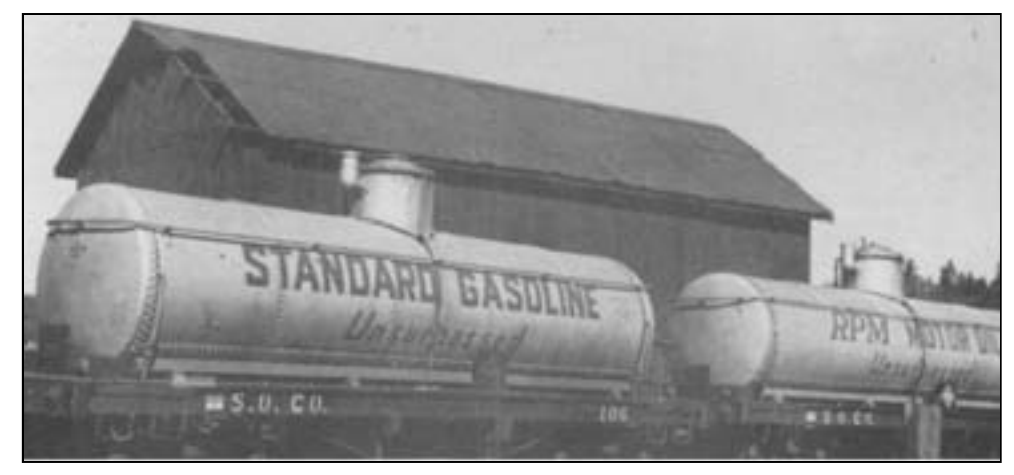
Figure 4: Standard Oil owned tank cars for refined retail product with advertising on the sides. These cars were numbered X-106 and X-107.