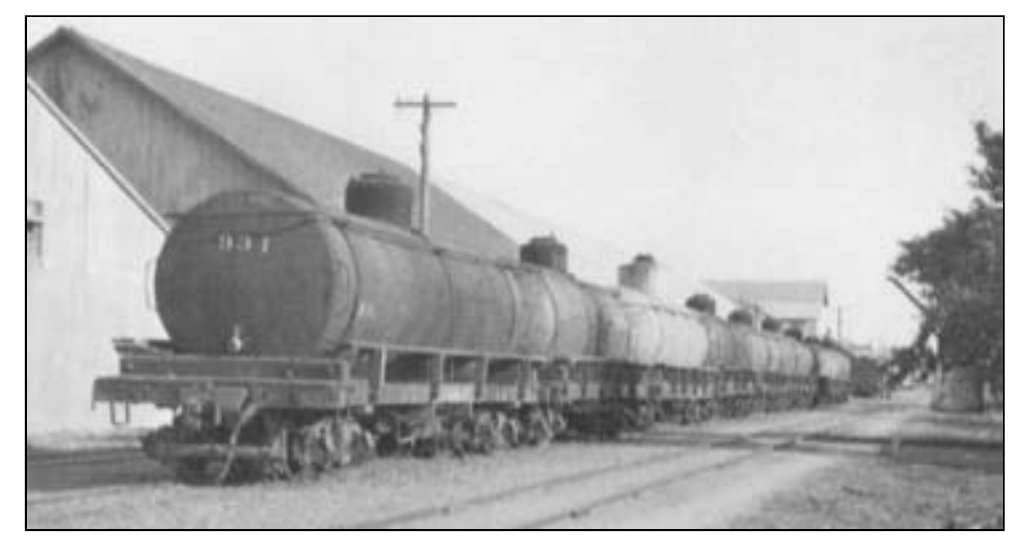
Figure 1: A string of steel tanks on narrow gauge flatcars at Santa Maria in 1939.