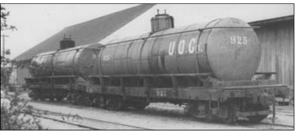
Figure 3: Tank car #925 lettered U.O.Co. for the Union Oil Company, Santa Maria, 1938.

Other noted fields were developed at Palmer and Cat Canyon southeast of Santa Maria and the PCRy extended a branch line