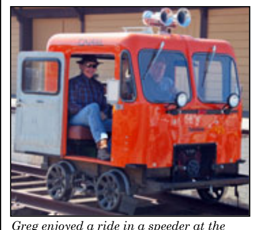
Open House on October 9, 2010.