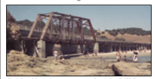
Bridge No. 5 in 1977.

The article, by Andrew, outlines a brief history of the PCRy and exacting details of the planning and construction of the model. This article is an excellent source of information for anyone wishing to build a model of this bridge.