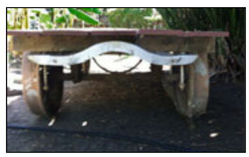
End view of PCRwy Push Car.

This Pacific Coast Railway push car is unique as it is the only PCRy push car in existence. It was built in the machine shop of the railway, which was attached to the round house located at the corner of Higuera and South Streets in San Luis Obispo. The car frame is taken from an early design Model-T Ford automobile. The track gauge of