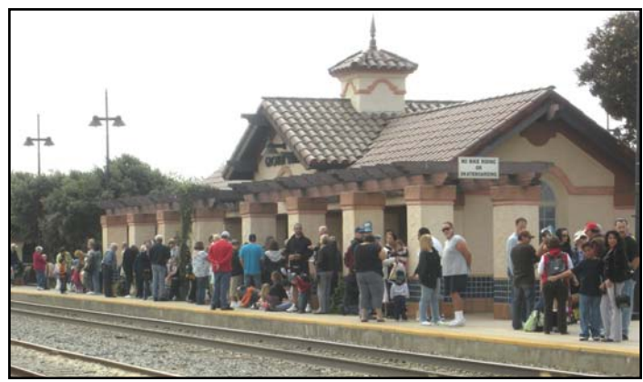
2009 Festival excursion passengers wait for the northbound Pacific Surfliner to visit the SLO Amtrak Station and Museum's Freighthouse.