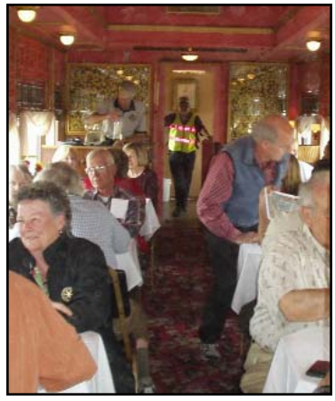
Rotarians enjoy scenery from the LaCondesa on their trip through the Santa Maria Valley.

Members of the San Luis Obispo Rotary Club, along with family and friends, recently participated in the first museum sponsored excursion aboard our parlor lounge car LaCondesa. The Rotary Club has been a long-time supporter and benefactor of the museum. They were instrumental in funding the transport of the car to the Central Coast, and the beginning of its restoration. The trip aboard La Condessa was an expression of appreciation by the museum for the relationship which has developed between our organizations, and the significant contribution Rotary has made during the early stages of our development.