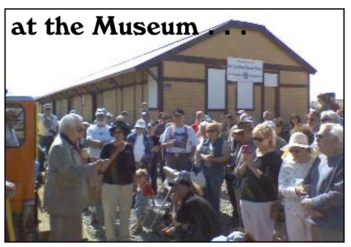
On October 10, 2009, San Luis Obispo Mayor Dave Romero reads a proclimation dedicating the Museum display track prior to driving the Golden Spike to finish the job.