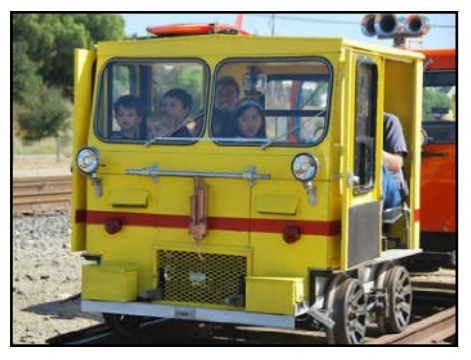
Visitors riding in a speeder driven by Roy Gammill.