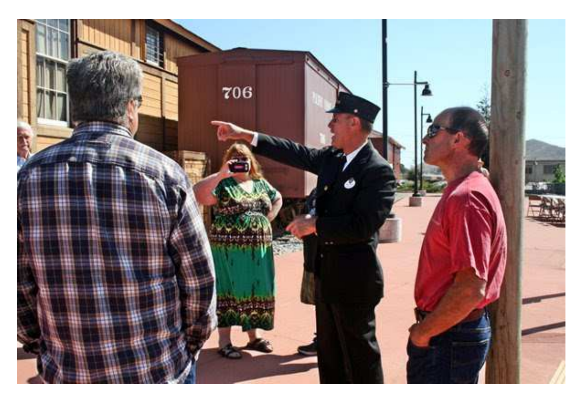
CENTRAL COAST RAILROAD FESTIVAL OCTOBER 13-15, 2017

Our annual railroading event is coming up. Hear speakers, shop the swap meet, go on a tour of local model trains, visit with other train enthusiasts, taste Pomar Junction wine, see our newest exhibit on the Santa Maria Valley Railroad, and so much more. Check the Central Coast Railroad Festival website for details, www.ccrrf.com. For questions, or to reserve a selling space on the platform, contact media@slorrm.com or call 805-548-1894.