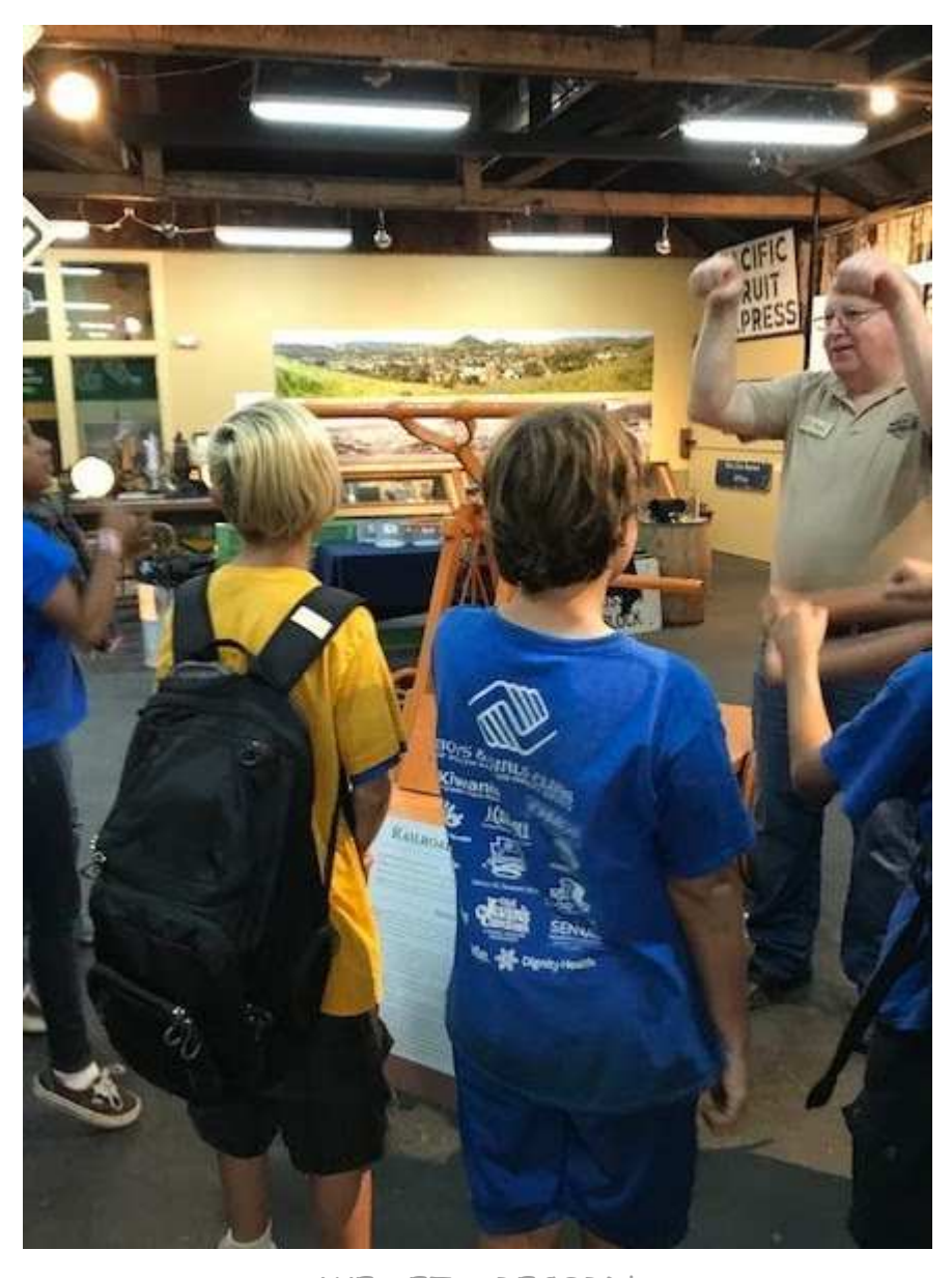
WE SET A RECORD!