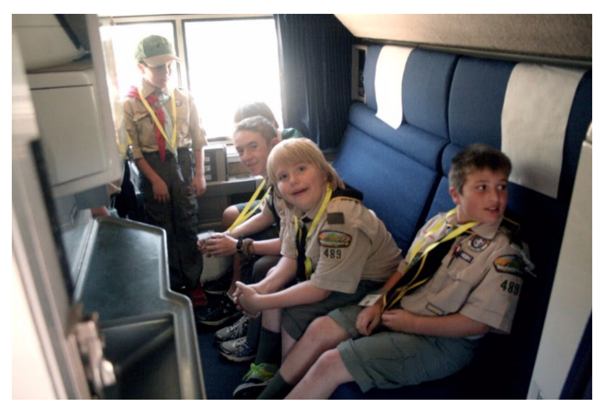
OUR LAST BOY SCOUT RAILROADING MERIT BADGE DAY

The Railroad Festival is coming up in October, so mark it on your calendar. There will be many activities throughout the County, including Railroad Story Times at local libraries, a list of local train layouts open to the public for the weekend, a swap meet, a kid's play area, face painting, and a bike ride along the historic Pacific Coast Railway right-ofway. Stay tuned for more info.